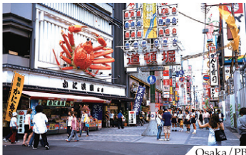
Osaka / PB